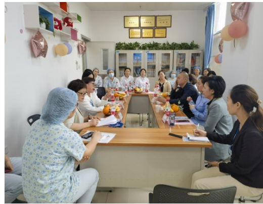
现场探讨深入热烈 The in-depth and heated discussion

会场外，我院消毒供应中心还特意布置了三个展台，分别展示了清洗、消毒、灭菌、监测等耗材及相关的手术器械。通过专业讲解和实物展示等方式，让临床科室老师及外消服务单位的同仁们，更加深入地了解消毒供应的工作内容及标准等知识。