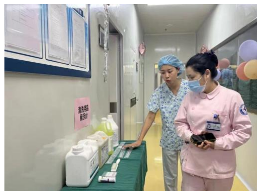
展台参观交流指导 Visit Exhibition Tables