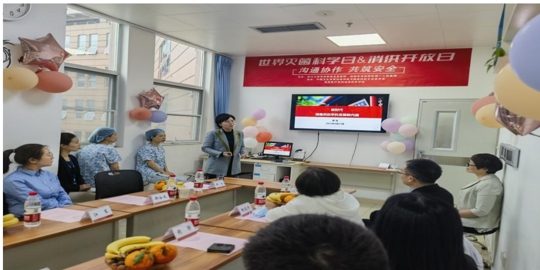
黄浩教授专题讲座 Huang Hao's Lecture

advantages of our location, seized the historical opportunity of integrated healthcare system, and strengthened the construction of the discipline of sterile supply to promote the overall development of sterile supply in the Longquanyi District. At the same time, she pointed out the direction for the personal improvement and development of the staff of the CSSD.