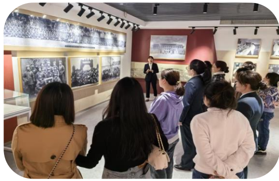
Onsite Visit-Patient Group