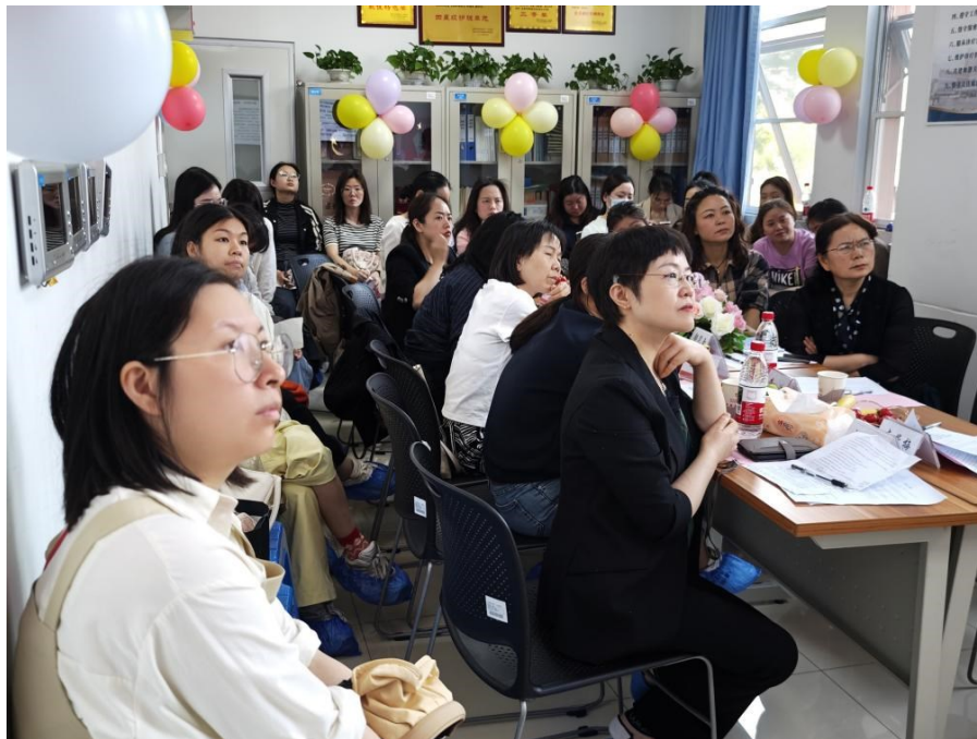
Participants are focusing on the lecture

After the lecture, an enthusiastic discussion session began, where representatives from various offsite sterile supply centers and clinical departments actively spoke up about difficulties, doubts, and challenges they encountered in their work, with Huang Hao and quality control experts providing precise answers and engaging in deep discussions.