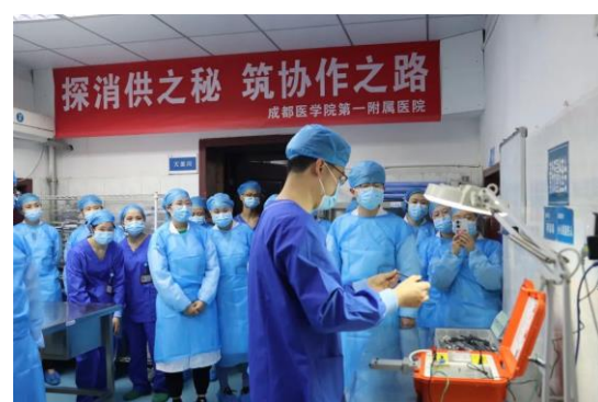
Live Demonstration of Insulation Inspection of Electrosurgical Instruments