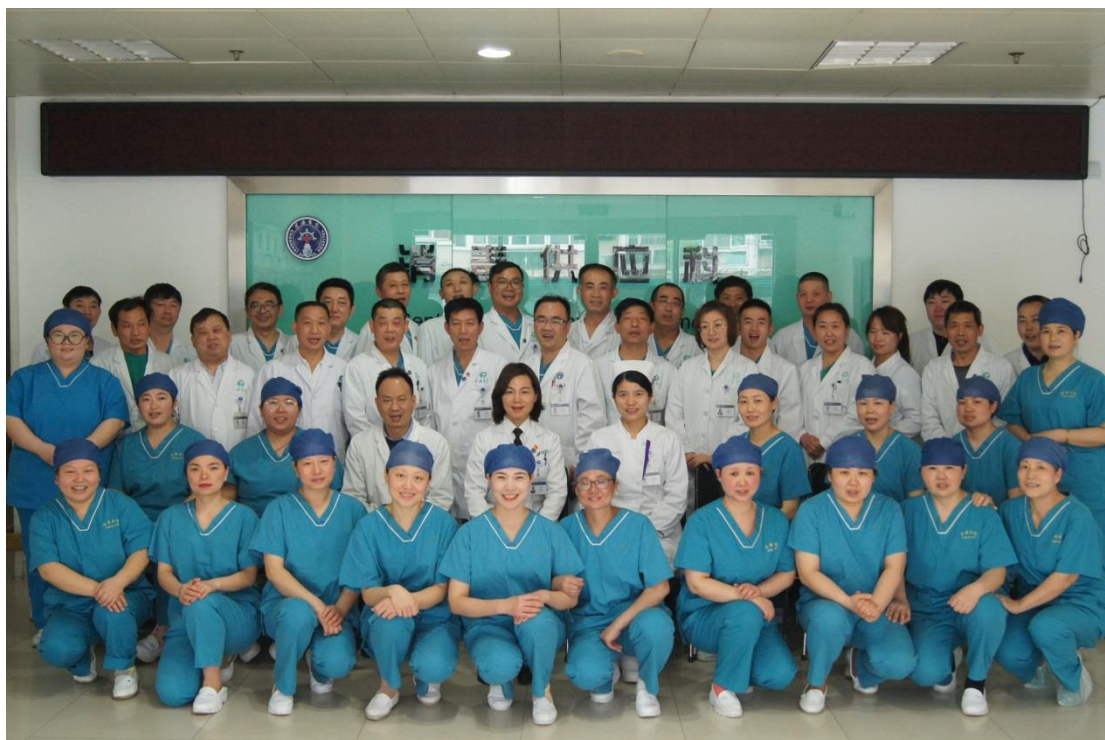
The whole family of CSSD staffs in Shanghai Changhai Hospital