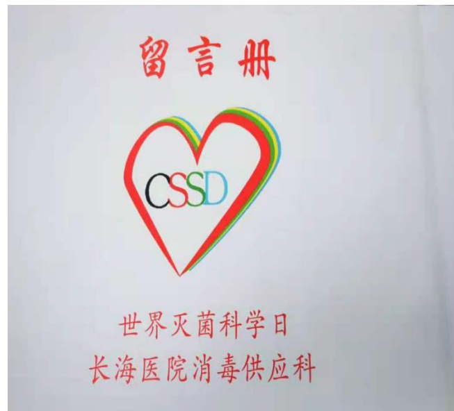
(Guestbook of CSSD, Shanghai Changhai Hospital)