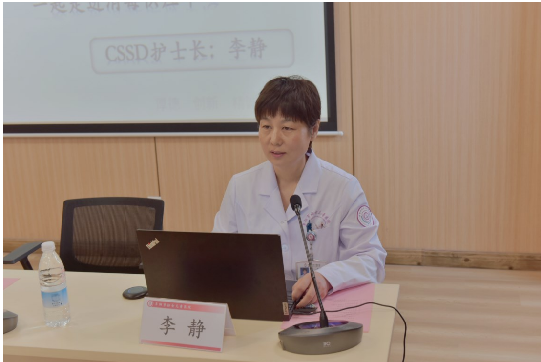
Watch the video: The Life Journey of Instruments.