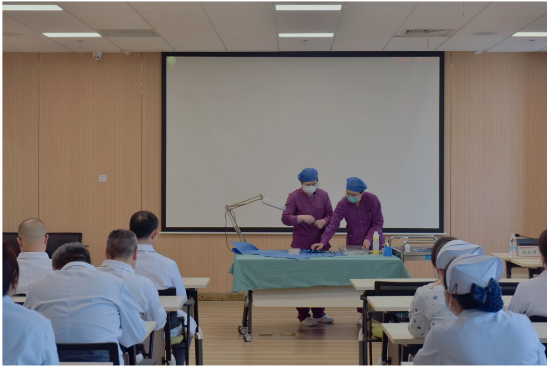
Showing materials and consumables used in the CSSD