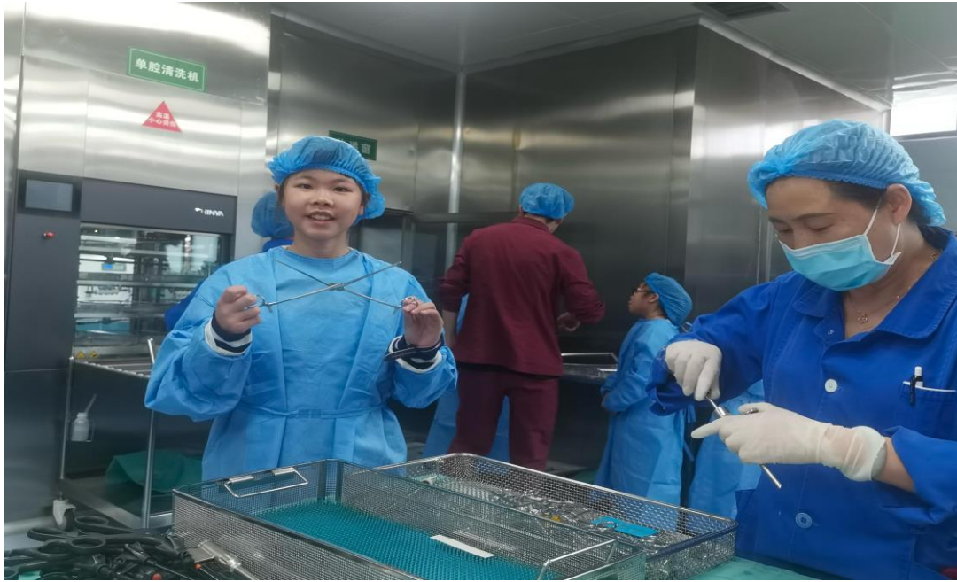
Children were learning how to pack