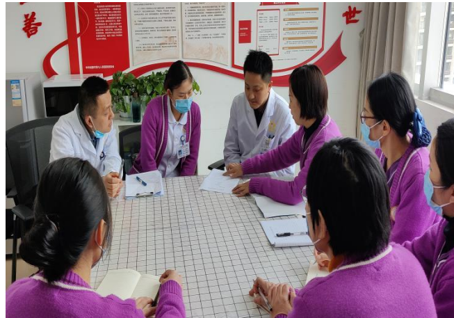
3 月 13 日“小分队”来到胃肠外科

leaders, quality control personnel, liaison officers and other staff. Everyone was dressed in uniform and had a pleasant conversation with the department at the appointed time.