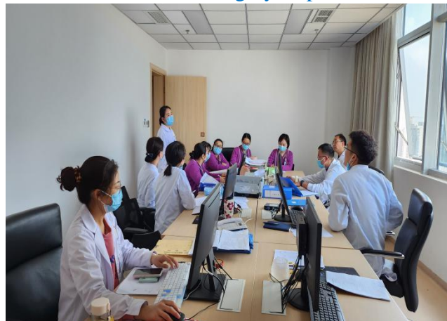
3 月 21 日“小分队”来到肛肠外科

The team visited Gastrointestinal Surgery Department on March 13.