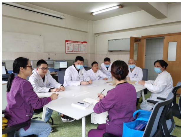
3 月 31 日“小分队”来到外科二病区

The team visited Anorectal Surgery Department on March 21.