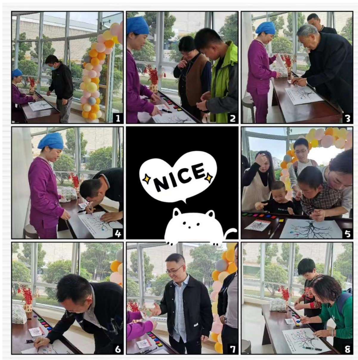
活动现场签名 Signatures in the Activity

The activity started at 14:00 p.m. on April 9, 2023. The participants first pressed their handprints and signed on the signature tree at the entrance. It was an activity full of joyful atmosphere, full of pride, and full of the warmth and love of the families.