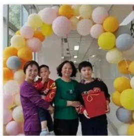
Group Photo in Working Area