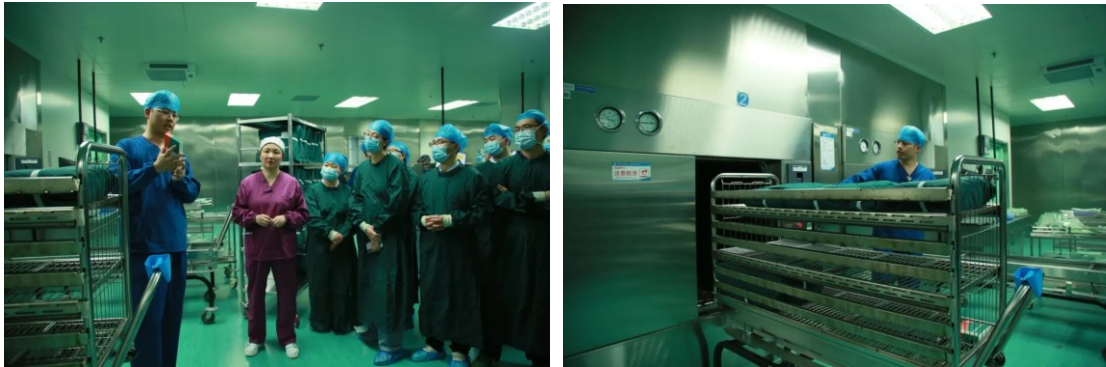
检查包装灭菌区 Inspection, Packing and Sterilization Area

Sterilization—including steam sterilization and low-temperature sterilization—were precisely applied according to device requirements. Physical, chemical, and biological monitoring systems were used to ensure sterilization effectiveness.