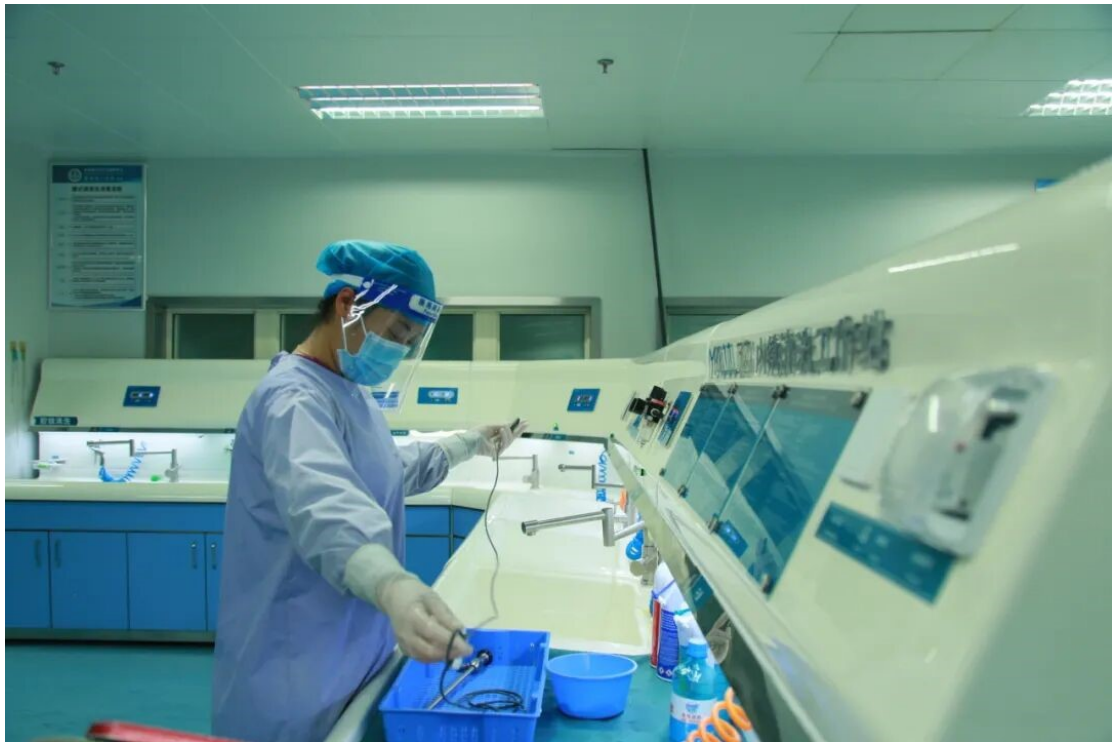
检查包装灭菌区 Inspection, Packing, and Sterilization Area

检查包装灭菌区尽显“匠心”，每一件器械都经过严格的清洗质量及功能性检查；并进行专业保养与标准化包装。