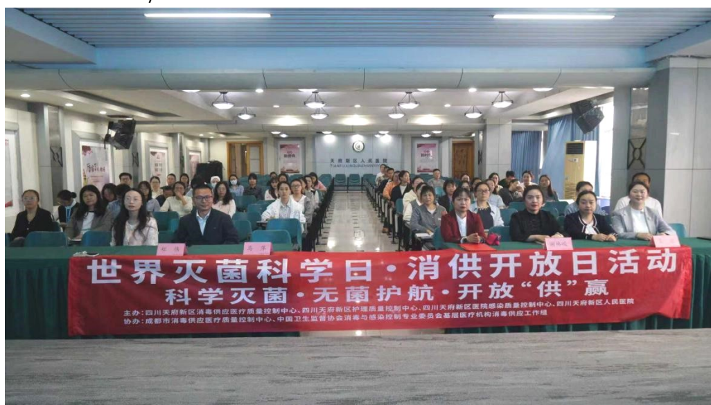
开幕式 Opening Ceremony

The event was held under the theme “Scientific Sterilization · Ensuring Safety · Open CSSD, Shared Excellence,” and featured a mix of on-site tours, lectures, educational sessions, and interactive workshops. More than 100 participants attended, including experts from CSSD, nursing, and infection control quality control centers in the Sichuan Tianfu New Area, as well as staff from primary healthcare institutions and clinical departments across the hospital. By combining learning, observation, and hands-on practice, the program helped participants translate knowledge into practice and was widely well received.