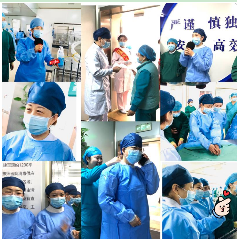
All members of the nursing department participated in this event