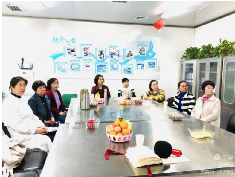
Retirees participated in activities

Providing effective disinfection and sterilization,